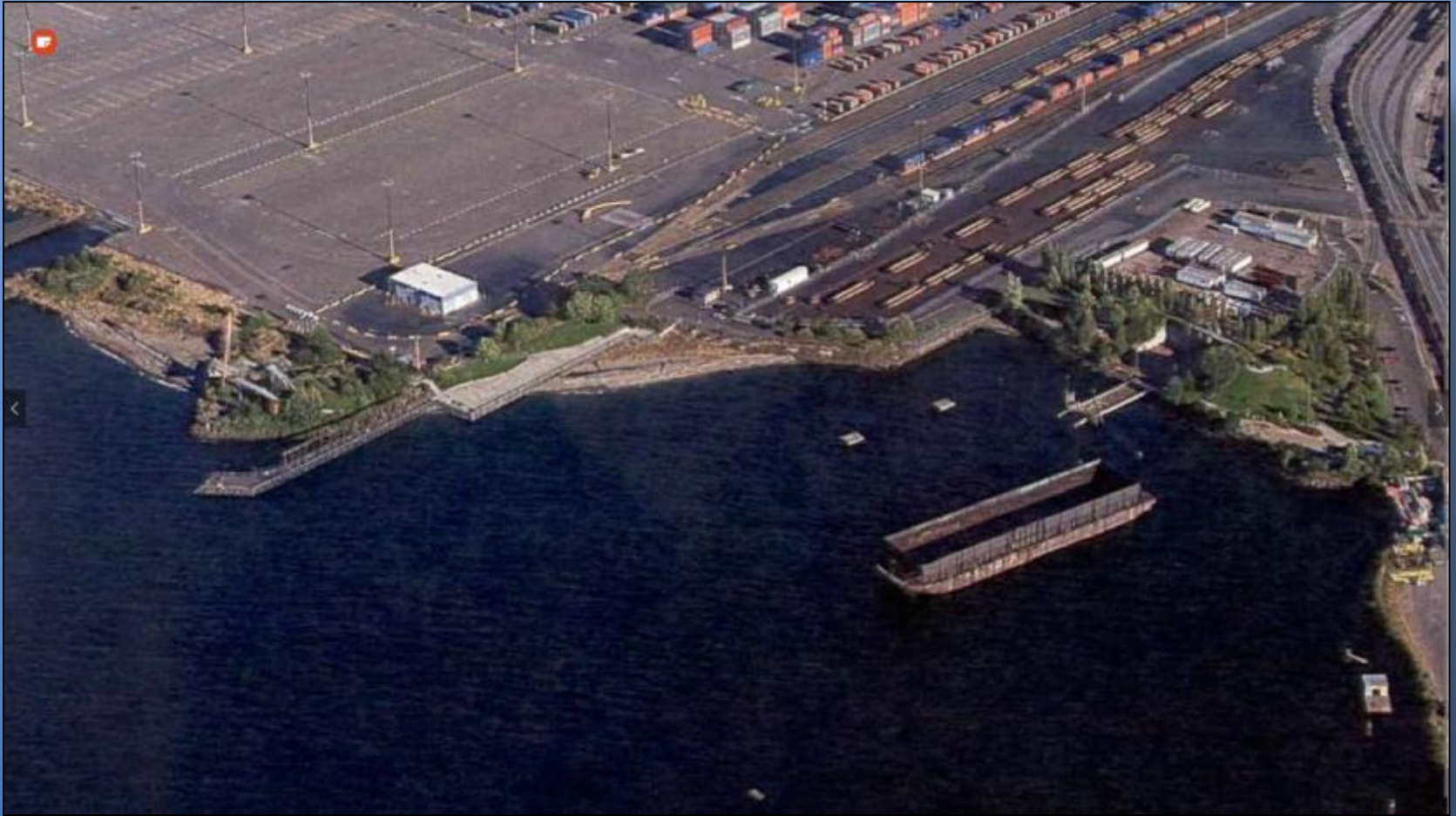
Pacific Sound Resources, Seattle, WA 2015