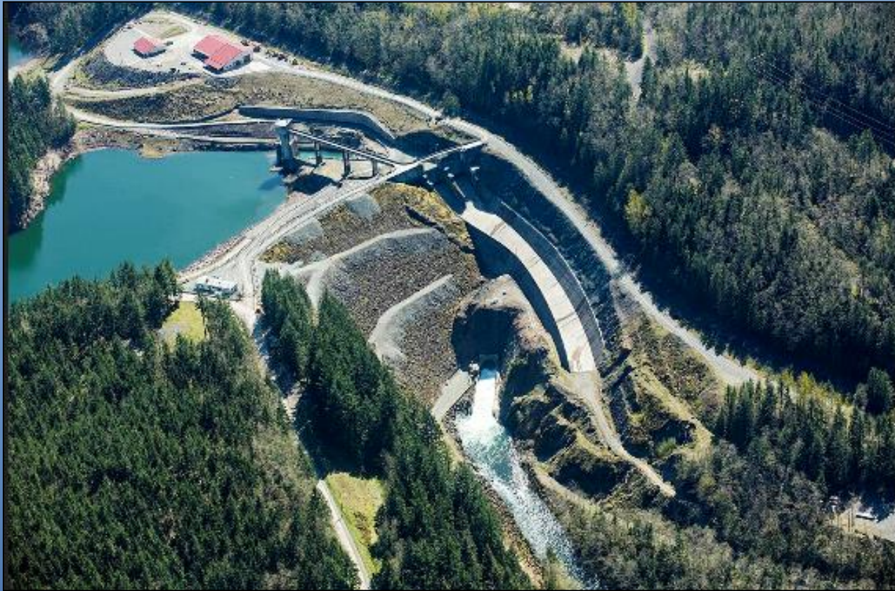
Howard Hanson Dam, King County, WA