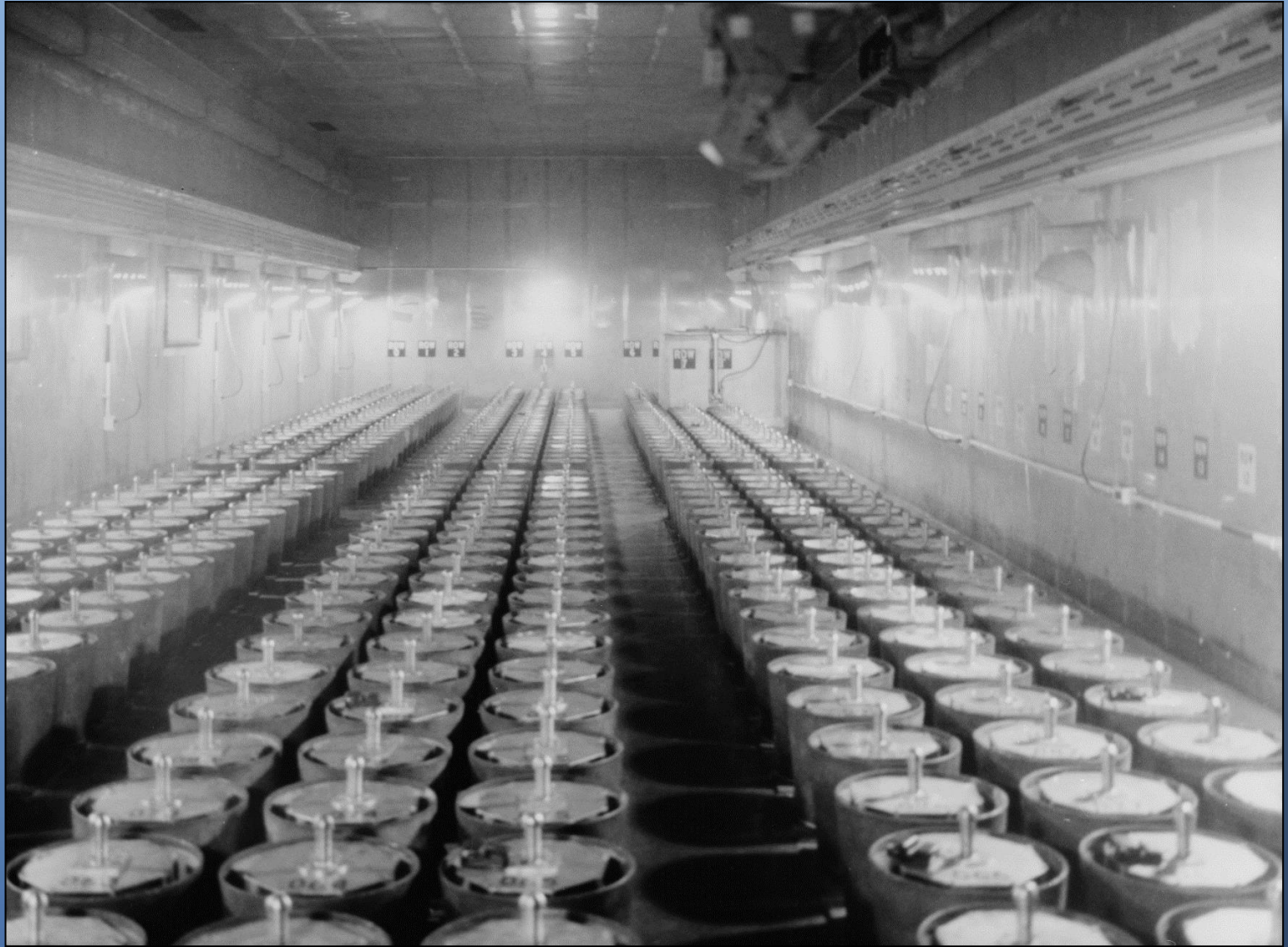
“Infinity Room,” Rocky Flats Plant, CO