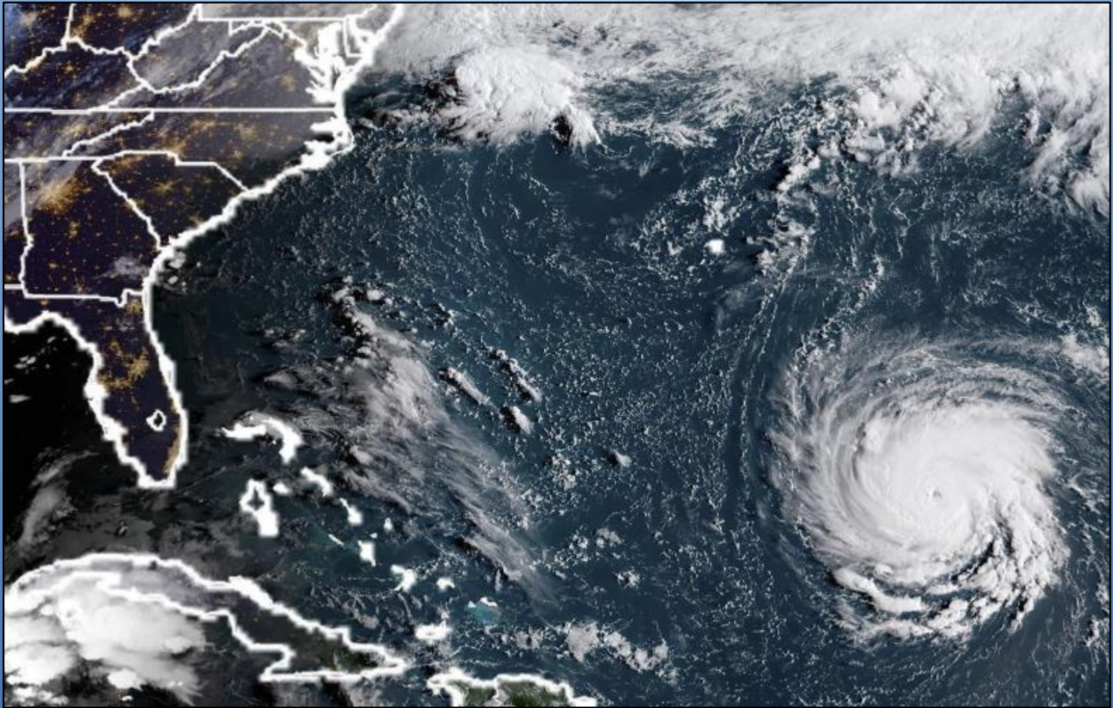
Hurricane Florence, Sept. 2018