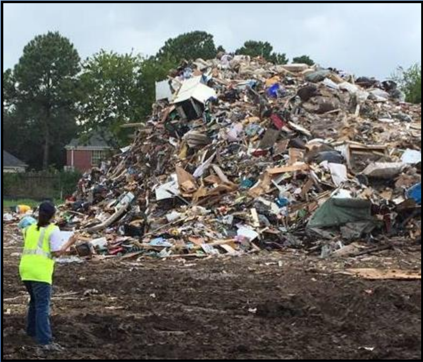
Sept. 14, 2017: Houston, TX