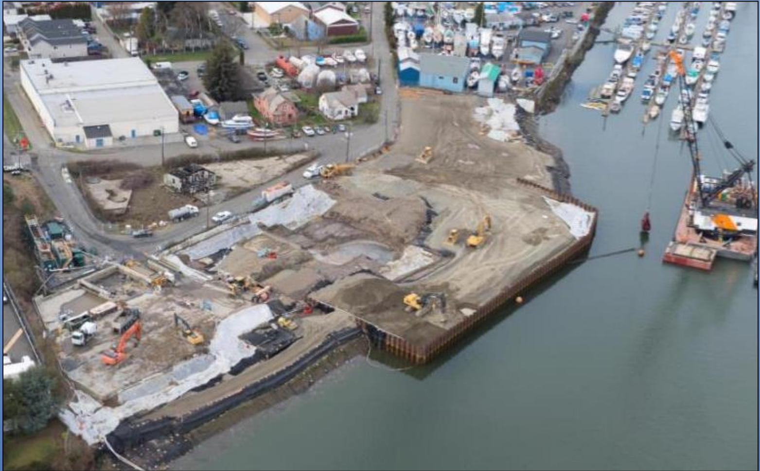
Terminal 117, Seattle, WA 2013