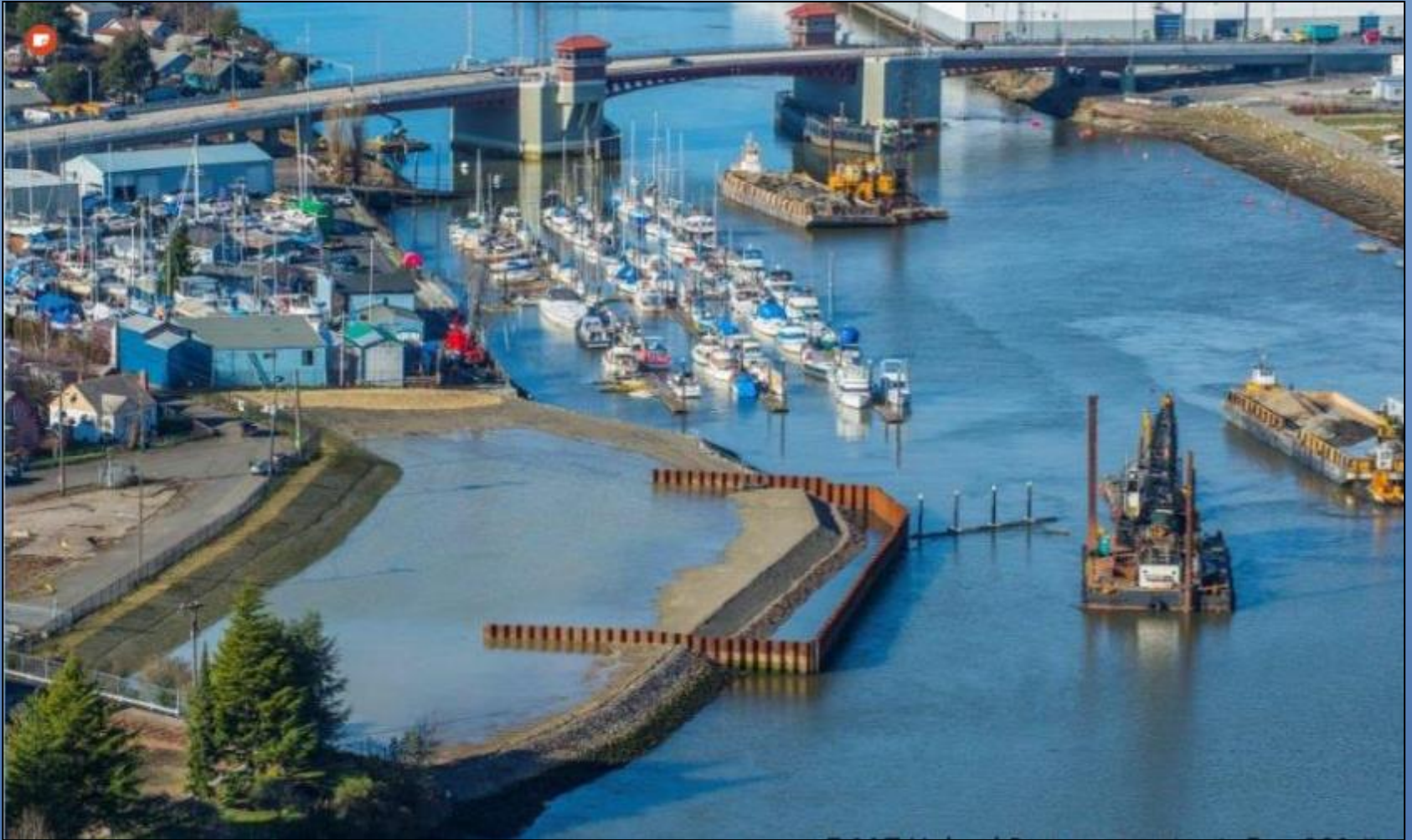
Terminal 117, Seattle, WA 2014