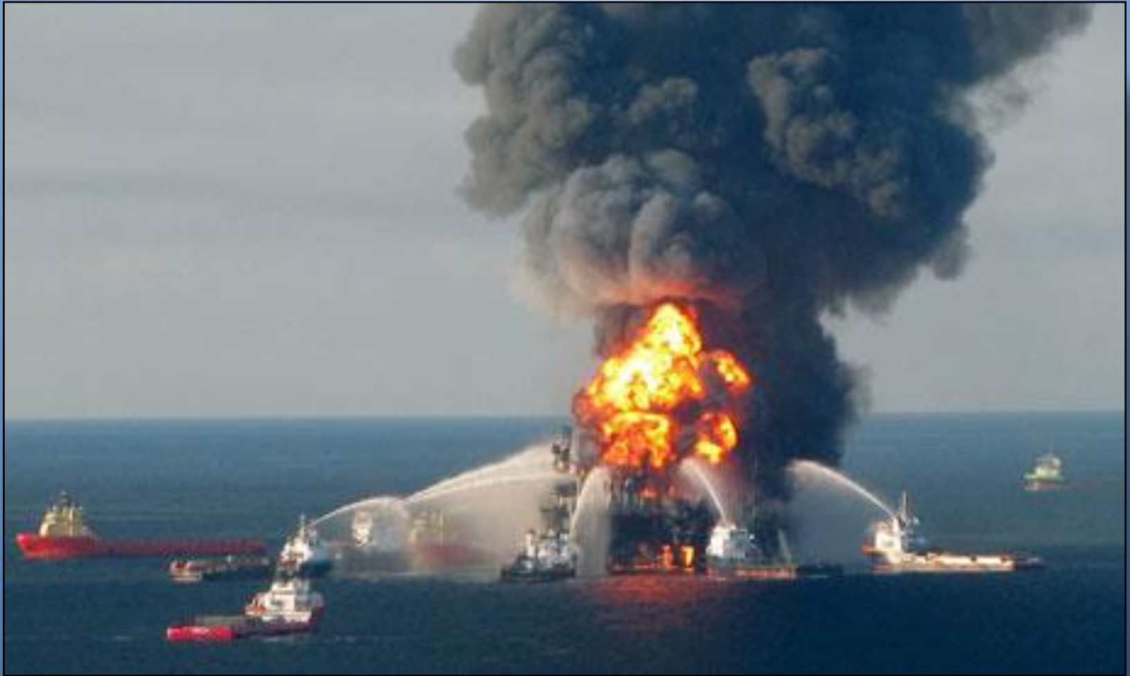
April 20, 2010: The Deepwater Horizon , Gulf of Mexico