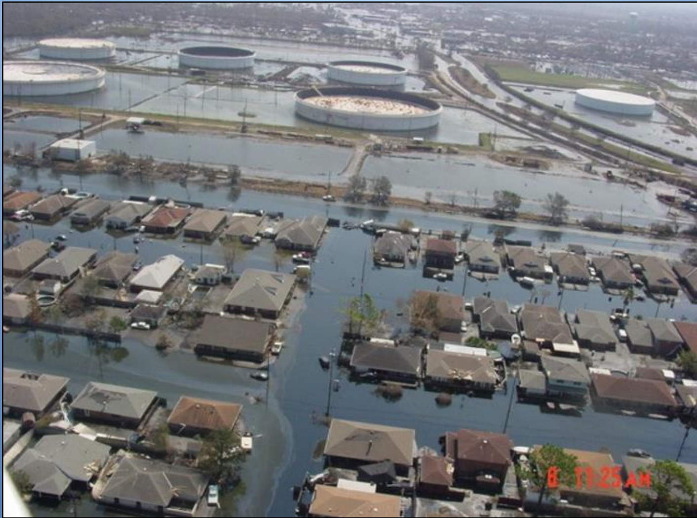
Murphy Oil Spill St. Bernard Parish, LA, Sept. 2005