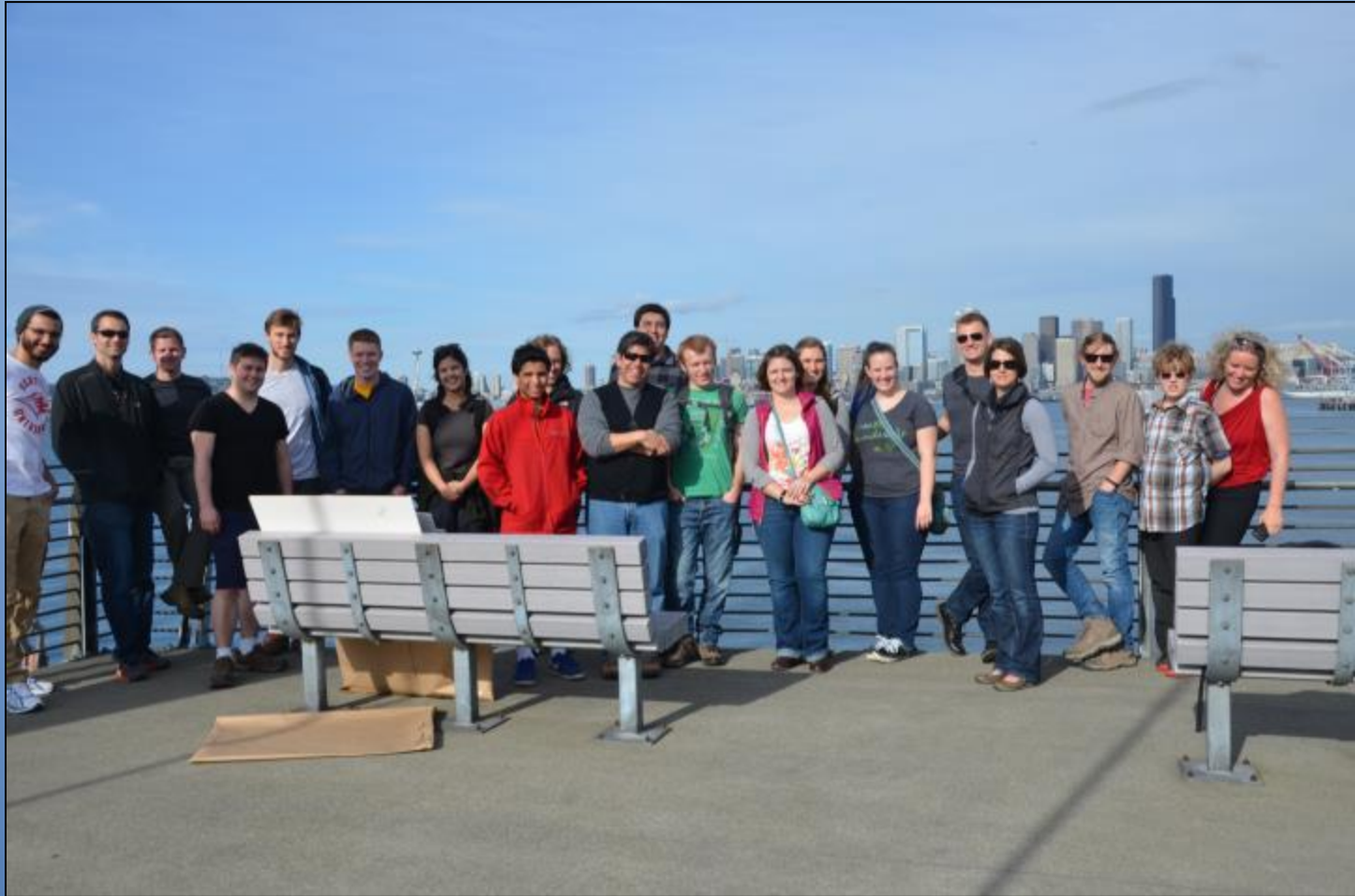
Pacific Sound Resources, Seattle, WA 2015